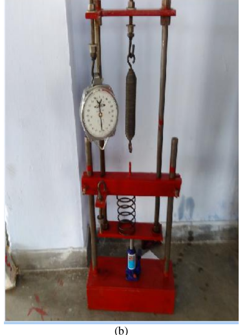
Figure 1. (a) Machine before completion, (b) Machine after completion.

In this work the spring constant and deflection of the spring at different loads have been calculated. A closed coil helical spring is used for calculating tension and open coil helical spring is used for compression. The component used for the fabrication of the spring testing machine are frame, hydraulic, spring weighing machine, open coiled and closed coiled helical spring etc. The combined testing of both tension and compression can be done as shown in figure 1.