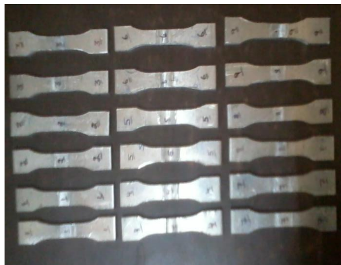
Figure 2: Specimen for the elongation

Then two tensile test specimens are extracted from each welded piece. The dimensions of the test specimens are according to American Society for Testing of Materials (ASTM) standard and after extract from the welded plates are shown in fig.2. The values of % elongation were recorded and plotted as per Taguchi design of experiments methodology. Table.3 & Table .4 shows the values of % elongation against the input parameter setting for L9 orthogonal array.