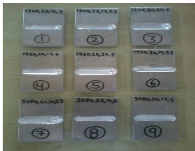
Figure 1: Plate after friction stir welding

The welding of two plates of AA 5083 is done according to the entire nine trail run. The joined plates after welding are shown in fig.1.