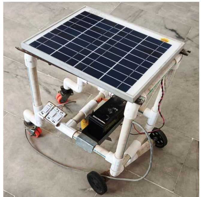
Figure 3: Solar Grass Cutter.

developed model is shown in Fig. 3. Fig. 3 shows the fabricated prototype of the solar-powered grass cutter, designed to function efficiently using renewable solar energy. The setup prominently features a solar panel mounted on the top frame, which harnesses sunlight and converts it into electrical energy for powering the system. The supporting structure is built using PVC pipes, providing a lightweight yet sturdy chassis that houses all essential components in a compact arrangement. Beneath the solar panel, a battery unit is securely installed to store the converted solar energy. This stored energy is later used to drive the motor and cutting blade. Visible electrical wiring connects the solar charge controller, battery, and manual switches, indicating an integrated control circuit to regulate voltage and manage power flow within the system. The presence of manual switches on the front panel allows the user to control the motor operation conveniently. The prototype includes two fixed rear wheels and two front caster wheels, ensuring smooth maneuverability across various terrains. The overall design reflects simplicity, portability, and functional integration, making it suitable for small to medium-scale grass cutting tasks. This real-time implementation validates the proposed system's viability in utilizing clean solar energy for efficient, eco-friendly lawn maintenance.